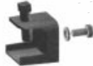
Non-Insulated Tower Kit