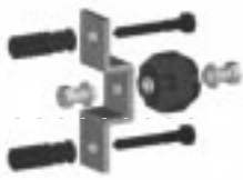
Insulated Shelter Kit

Buss Bar Attachment Hardware facilitates installation of Ground Buss Bars in virtually any application. Four models are available, providing your choice of insulation and mounting style. The shelter-mounted kits feature brackets for wall-mounting in shelter and roof-top applications. The tower-mounted kits utilize angle adaptors to facilitate installation on angle tower members. Insulated and non-insulated Buss Bar Attachment Hardware are also available. Ground Buss Bars must be purchased separately to suit your exact grounding requirements. These hardware solutions are also provided with the buss bar as part of a complete Ground Buss Bar Kit.