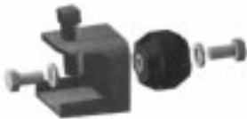
Insulated Tower Kit